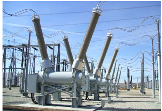
Vincent 500/220-kV Substation Expansion

In 2006, Sargent & Lundy provided support for the preparation of SCE's Proponent's Environmental Assessment (PEA) for a portion of the project, including preliminary design and document preparation. In 2009, work began on detailed engineering for Segment 10, which consists of a new 18-mile, single-circuit, 500-kV line that will connect the proposed Whirlwind Substation to the Windhub collector substation. The scope of work includes structure spotting, material selection, foundation design and preparation of construction specifications.